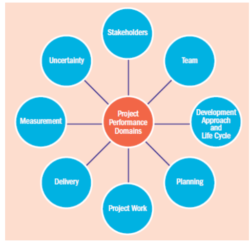
Guide Behaviors, PMBOK 7th Ed, Page 5

The project and product managers share similarities in their roles. And in some environments, both managers will work on the same project but at different stages of the product’s march from concept to development to delivery. Please read this article outlining the similarities and differences between both manager types.