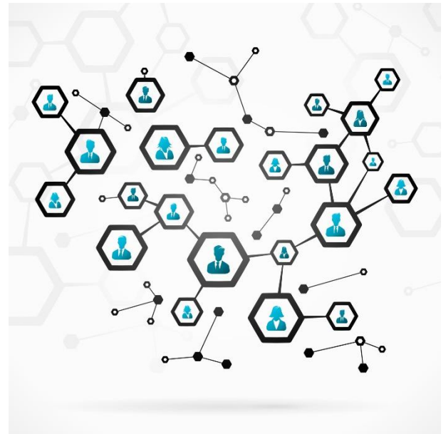
People Network (CoachTrains)